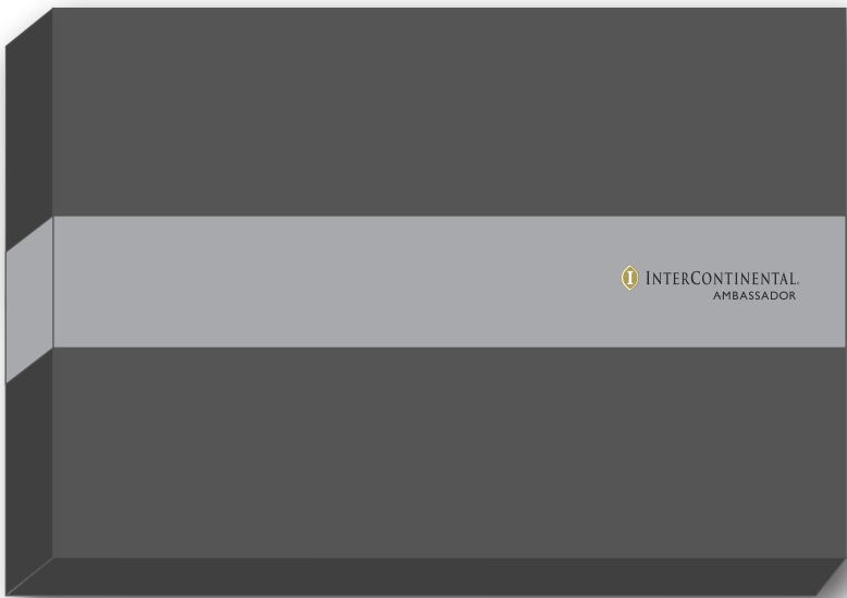
Platinum Ambassador / Silver Box